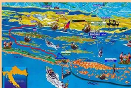
1. Day / Zadar - Sali, Dugi otok