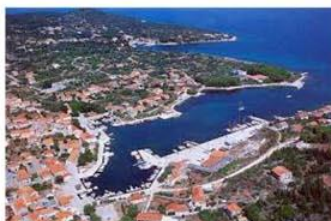
Dugi otok, Sali