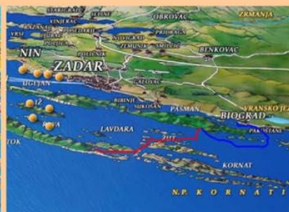
2. Day / Sali - Biograd